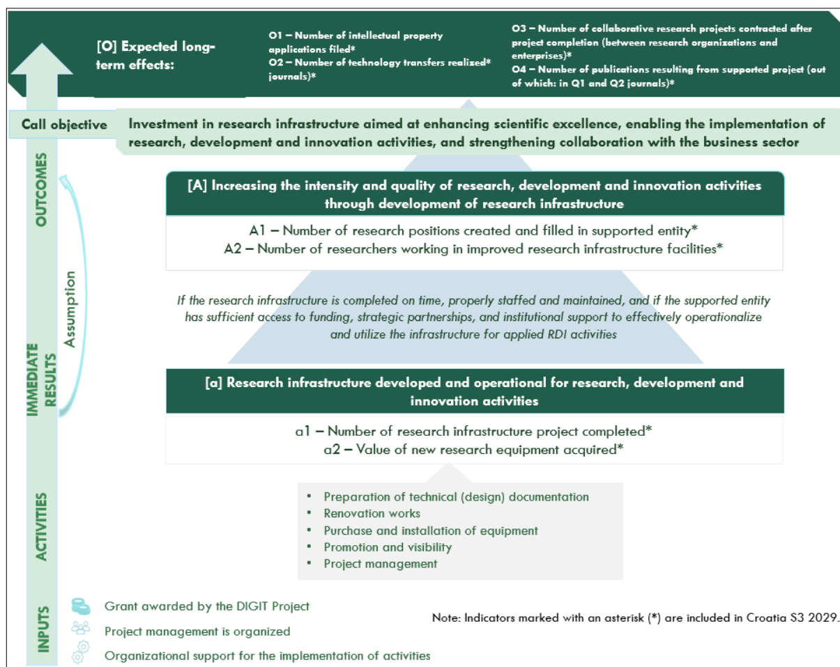
Table 1. Results framework of the Call